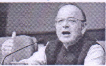
[ NT Bureau | Chennai, Aug 3:

However, there is no confirmation whatsoever on this issue and issues relating to the Seventh